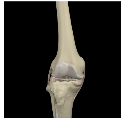
Interactive Knee 1.1