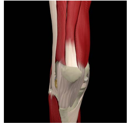
Interactive Knee 1.1 © 2000 Primal Pictures Ltd.

Scar tissue adhesions will accumulate not only in and around the knee, but also at the hip, foot, and other areas along the kinetic chain. This scar tissue build-up will place more and more strain on the knee as the muscles must now stretch and contract against these adhesions. This further increases the strain to an already overloaded knee, which in turn leads to more micro-trauma. Essentially a repetitive injury cycle is set-up causing continued adhesion formation and progressive movement dysfunction. As the cycle progresses the ability of the muscles to contract properly is affected and the control and stability of the knee becomes compromised. At this point it is not uncommon for the muscles to give way and for a more severe pain to occur. As you can see from the explanation of this repetitive injury cycle, these types of injuries build-up over time and the more acute injury is often just the “straw-that-broke-the-camels-back.”