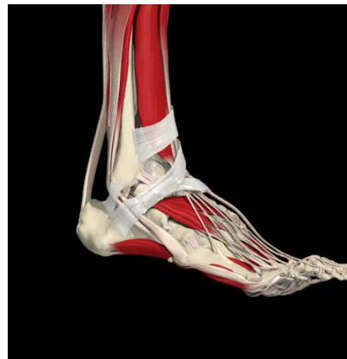
Interactive Foot and Ankle 2 © 2001 Primal Pictures Ltd