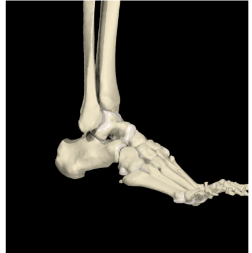
Interactive Foot and Ankle 2

As scar tissue adhesions accumulate in and around the muscles of the foot, ankle, and lower leg it places more and more strain on the area as the muscles and associated tendons must now stretch and contract against these adhesions in an attempt to move and stabilize the ankle. This places even further strain on the muscles, which in turn leads to even more micro-trauma. Essentially, a repetitive injury cycle is established causing continued adhesion formation and progressive ankle dysfunction. As the cycle progresses, the ability of the muscles to contract properly is affected and the protection and stability of the ankle becomes compromised. At this point it is not uncommon for the muscles to give way and a more severe and debilitating pain to occur – such as a muscle injury or ankle sprain. In fact, many athletes come into our office explaining how they have hurt their foot or ankle during a routine task that they have done thousands of times before. When further questioned these athletes almost always describe some mild pain or tightness that has been building over time. As you can see from the explanation of the repetitive injury cycle, these types of injuries build-up over time and the more acute injury is often just the “straw that broke the camels back”.