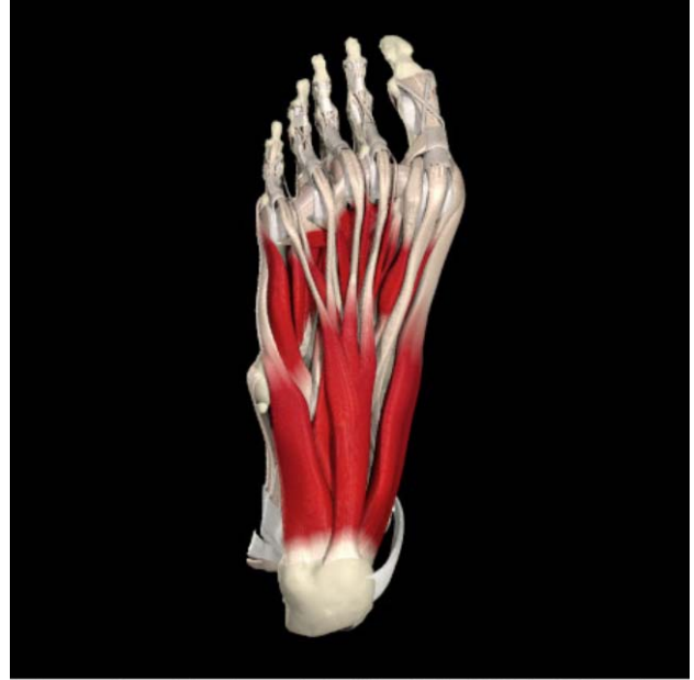
Interactive Foot and Ankle 2

As the muscles and fascia of the foot become strained and develop adhesions, they become very tight. As the tightness increases, the tissues begin to pull away from the heel where they attach,