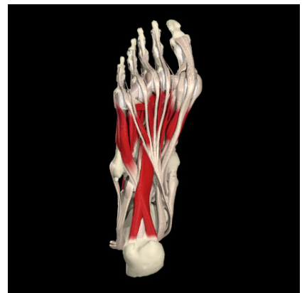
Interactive Foot and Ankle 2