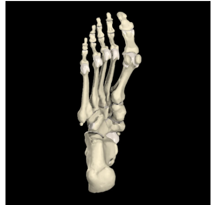
Interactive Foot and Ankle 2 © 2001 Primal Pictures Ltd

It is important to realize that beneath the plantar fascia the muscles are arranged in layers, and each muscle within each layer has a different job or function. For example, some of the muscles attach all the way into the toes and act to flex and stabilize the toes, while other muscles attach into the other bones of the mid-foot to control and stabilize the arch of the foot. For the foot and ankle to work properly, and to prevent pain and injury, not only does there have to be adequate strength and flexibility of the foot and calf muscles, but these different layers of muscles need to be able to glide freely over one another during normal use.