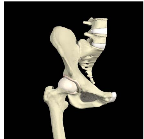
Interactive Hip

The muscle groups around the hip are essentially organized into opposing pairs. This means that the muscles on the front on the hip are paired with muscles on the back of hip and together these muscles control motion in the forward-to-backward direction. Likewise the muscles on the outer side of the hip are paired with the muscles on the inner side and this pair of muscles controls side-to-side movements. Other muscle pairs act to control inward and outward hip rotation as well. These “pairs” of muscles basically surround the hip so that together they can move and control the hip in all directions. When all the muscles are all working properly the chance of pain and injury is very small.