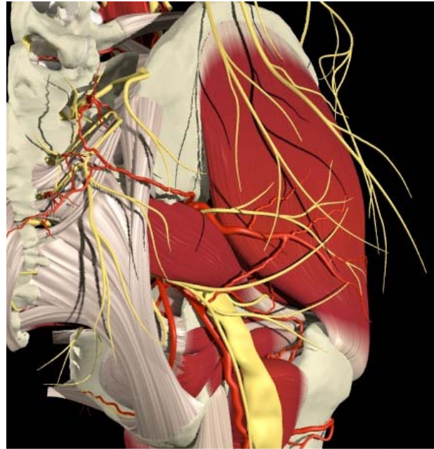
Interactive Hip © 2000 Primal Pictures Ltd.

Another type of hip pain can result from irritation to the nerves in the hip region. This occurs because as the nerves exit the spine and travel down the leg they pass around, under, over, and sometimes through the muscles in the hip region. When there is an accumulation of scar tissue adhesions in and around the hip this scar tissue can also affect the nerves. Just as the muscles need to be able to glide on each other, the nerves also need to be able to glide freely between the layers of muscles. In many cases the accumulation of scar tissue can cause the nerves to become “stuck” to the surrounding muscles and fascia. Instead of the nerves easily gliding between the muscles they become stretched and irritated and can lead to hip pain. It is quite common for a nerve entrapment at the hip to be misdiagnosed as a simple “bursitis” or “tendonitis”. Obviously an incorrect diagnosis will lead to incorrect treatment, which will not be effective in relieving the condition.